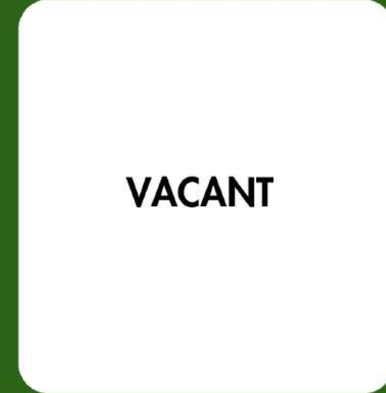
? ED OIL, GAS AND MINING MANAGER